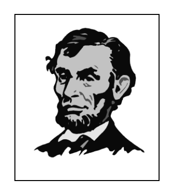
Presidents' Day February 20th