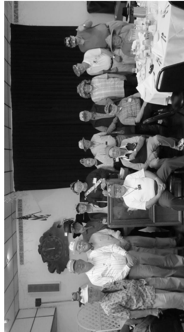
The Crazy Hat Day Contestants at the April SIR Luncheon