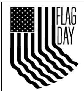
FLAG DAY June 14th

BE A SIR!!.. BE COMMITTED!! BE ACTIVE!!.. HAVE FUN!!..