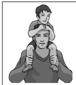
FATHERS DAY June 16th