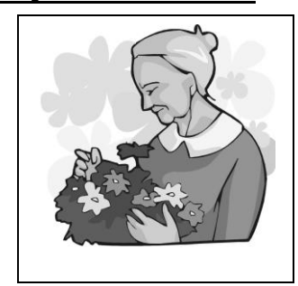
MOTHER'S DAY May 13th