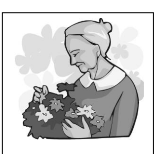
MEMORIAL DAY May 27th