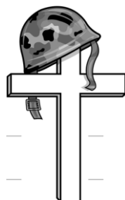
Memorial Day May 30 th