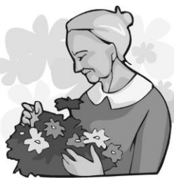
Mother's Day May 8 th